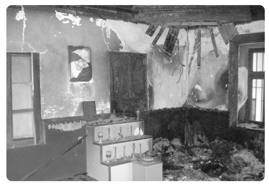
Fire damage at the Harabati teqe in Macedonia, 2011.