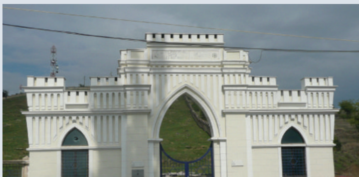
בית הקברות היהודי, ביטולה, מקדוניה Restored portal at the Bitola Jewish cemetery, Macedonia