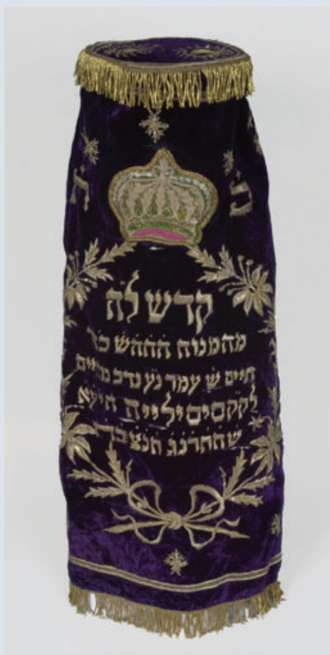
מעיל לספר תורה, סלוניקי, יוון, תרנ"ג (1892/3)

The Holocaust Memorial Center of the Jews from Macedonia