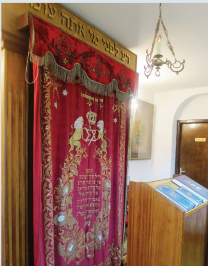
הפרוכת בבית כנסת "בית יעקב", סקופיה, מקדוניה The Parochet covering the Torah Arc of the Beth Jakov synagogue in Skopje, Republic of Macedonia