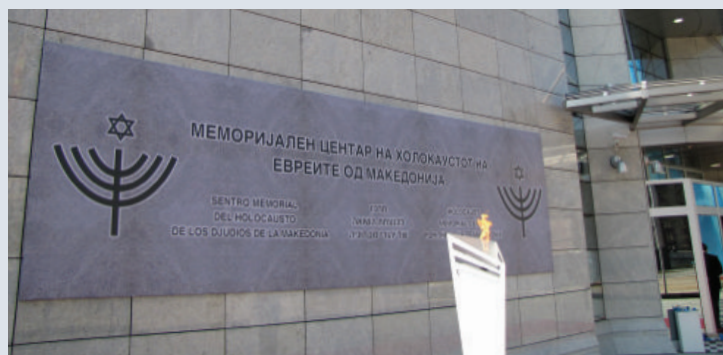
המרכז להנצחת יהודי מקדוניה בשואה

The Holocaust Memorial Center of the Jews from Macedonia