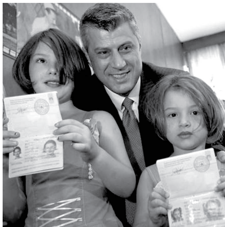
•Prime Minister Hashim Thaci presents passports to two young Kosovars

The Times article states that Giesecke & Devrient holds a contract worth $381,200 with the US government.