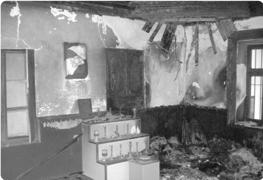
Fire damage at the Harabati teqe in Macedonia, 2011.