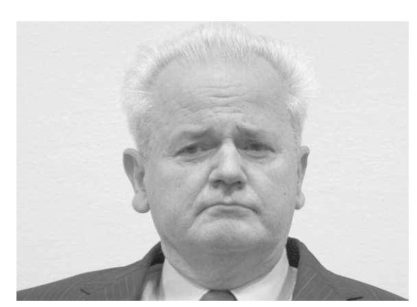
Osama bin Laden