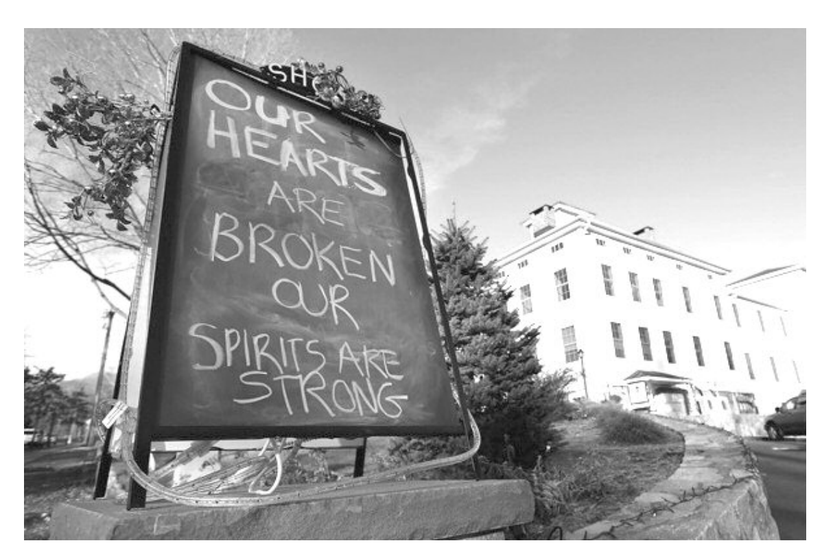
A sign outside of a local business in downtown Newtown, Conn., reads, "Our hearts are broken, our spirits are strong," the morning following a mass shooting at nearby Sandy Hook Elementary School.